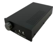
Power Supply (B)