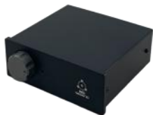
Power Supply (A)