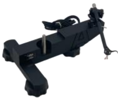
Chassis with Tonearm

Option C: All BLUE parts plus Upgrade Platter, Power Supply (B), Drive Belt x 2